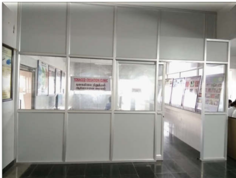
Tobacco Cessation Clinic