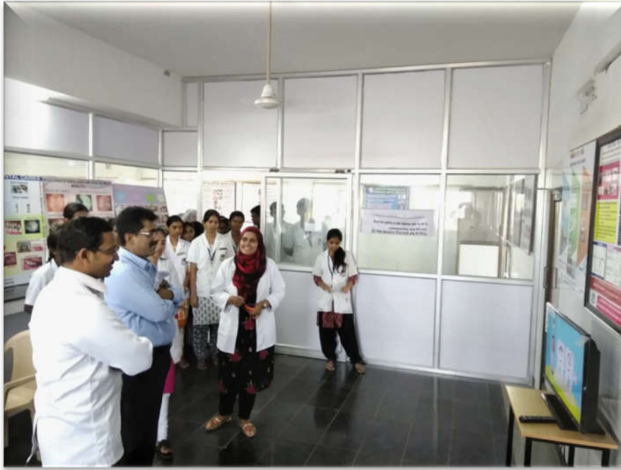
Tobacco Cessation Video – Released by Principal