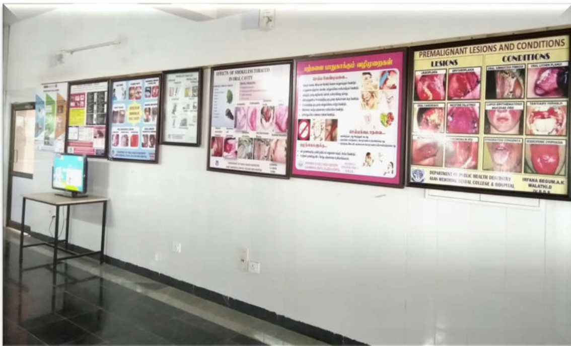
Tobacco Cessation Clinic Posters