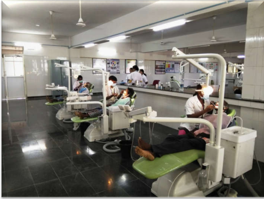
Screening of Patients @ Dept of Public Health Dentistry