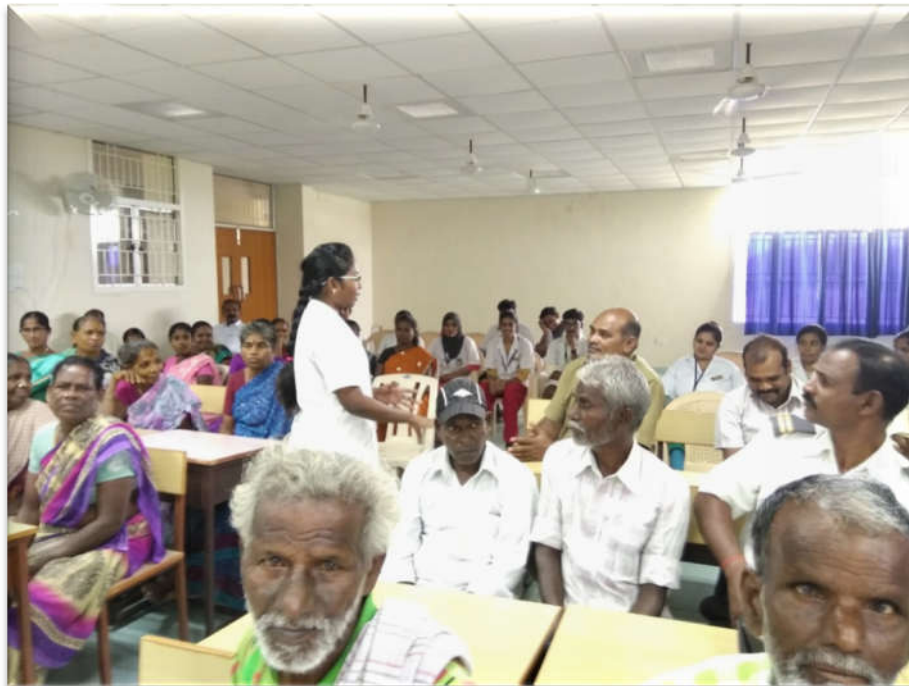
Interaction with Tobacco Users

In this session of ‘ Talk to Quit ’ the participants were interacting with the doctors of Asan Memorial Dental College and Hospital on their doubts regarding tobacco, alcohol, betel nut, quid etc., and how they cause cancer, they were also taught about methods available for helping people to quit the habit.