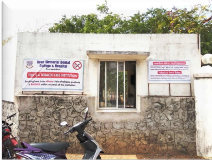
Display of Tobacco Free Institution